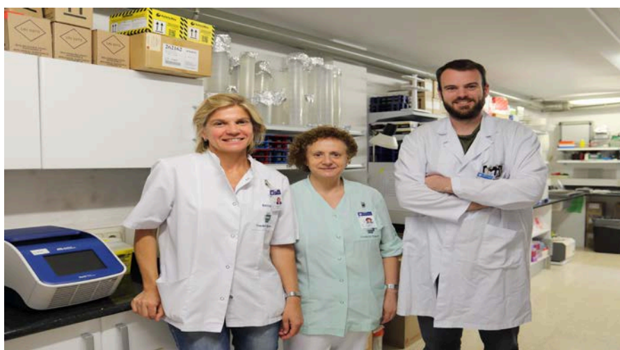
MEMBERS OF THE MOLECULAR- GENETIC LAB