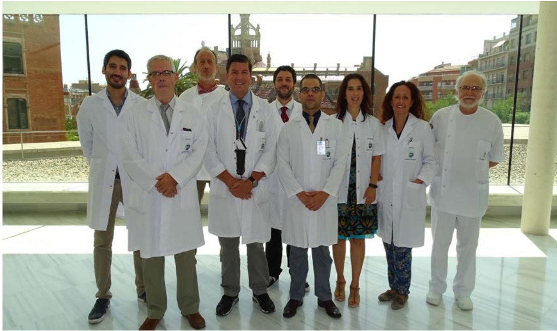
STAFF OF THE ANDROLOGY DEPARTMENT