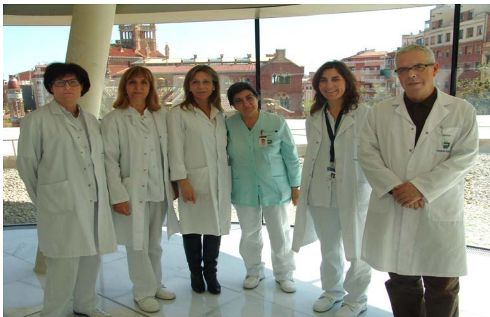
STAFF LAB OF SEMEN ANALYSIS AND EMBRIOLOGY