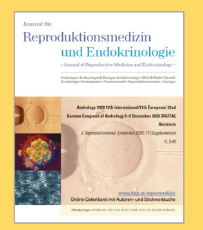
J. Reproduktionsmed. Endokrinol 2020; Vol. 17, Suppl. 1, pp 5-85

12th INTERNATIONAL CONGRESS OF 11th EUROPEAN CINCIOLOGY 32nd GERMAN CIGCOL 5-8 DEC 2020