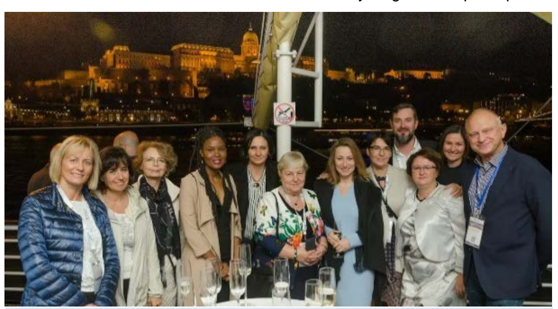
A group of delegates enjoying the beautiful views and balmy weather allowing a drink 'al fresco' at the congress banquet

a wonderful banquet held on a large boat Spoon , moored at the shore of Danube, with beautiful night views on the historic buildings flanking the river. The scientific highlights and pleasant social memories of ECA 2018 will for sure stay long with the participants.