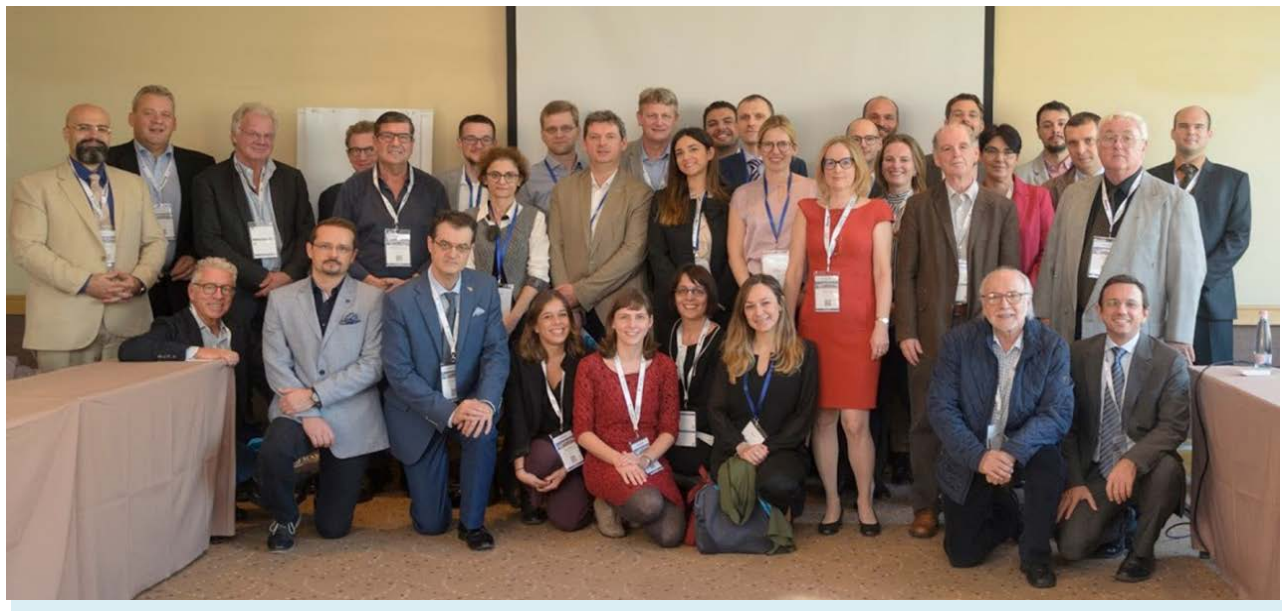
The newly minted EAA clinical andrologists and the examiners pictured on 11<sup>th</sup> of October 2018 in Budapest.

The largest ever number of applicants took the 21<sup>st</sup> edition of the exam on 10-11 October 2018, during the ECA in Budapest.